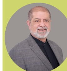
Ashfaq Taufique Birmingham Islamic Center